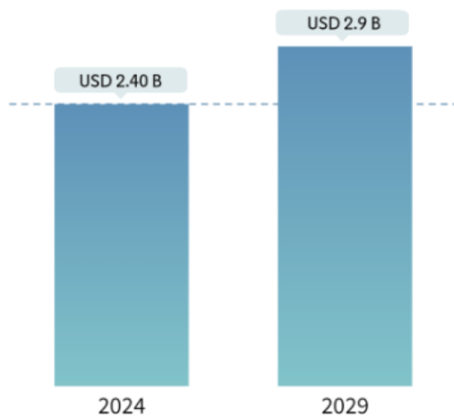
India Cashew Market Market Size in USD Billion CAGR 3.80%