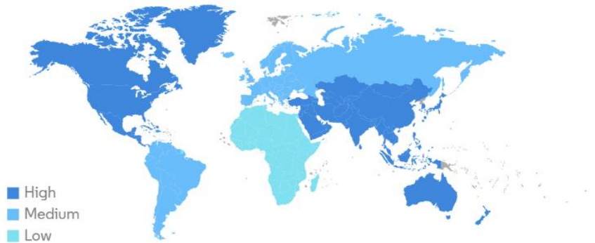
Cashew Kernel Market : Growth Rate By Region (2023-28)