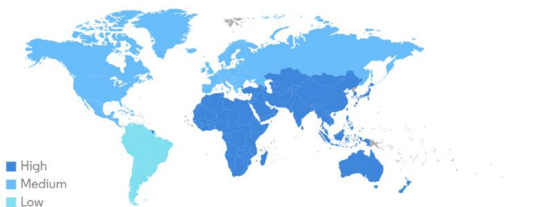
Cashew Market: Growth Rate in %, Region, 2024-2029